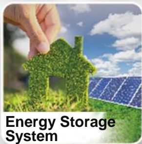
Energy Storage System